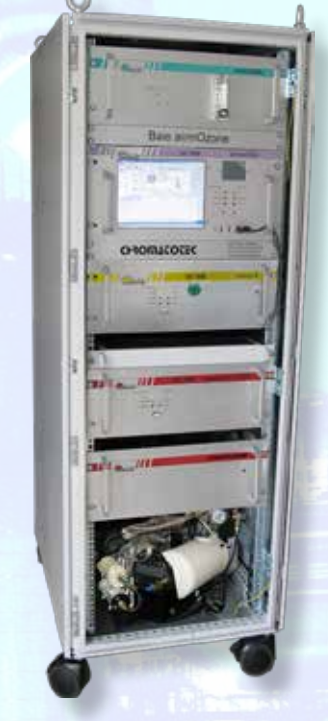
Odor's & VOC's Cabinet