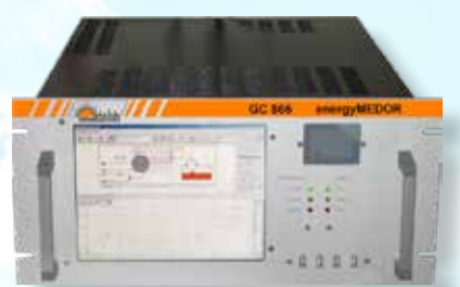
EnergyMEDOR® system 5U